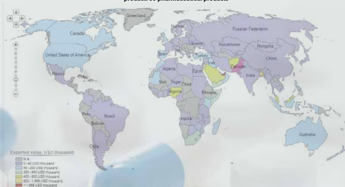
List of supplying markets for a product imported by Pakistan product: 30 pharmaceutical products