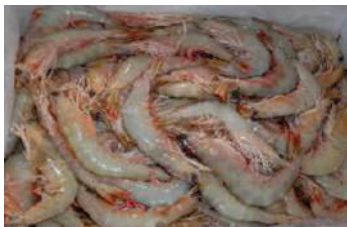
Shrimps/Tiger Prawns, Crustaceans (HS306)