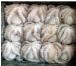
Baby Octopus, Other Fish Meat NES (HS304)