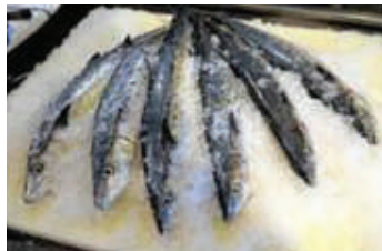
Frozen Mackerels/Sardines (HS303)