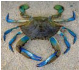
Blue Swimmer Crabs (HS306)