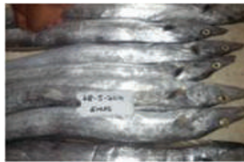
Fresh or Chilled Ribbon Fish (HS302)