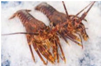
Rock Lobster, Crustaceans (HS306)