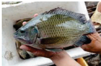
Tilapia Fish (HS303)