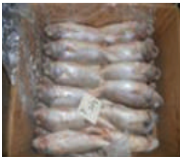
Yellow Croaker (HS303)