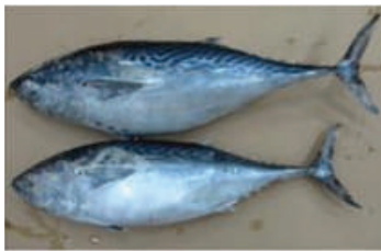
Skip Jack Tuna Fish (HS303)