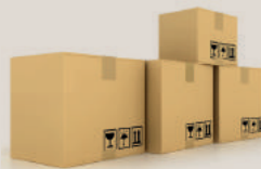
25kg Cardboard Cartons (Dates)